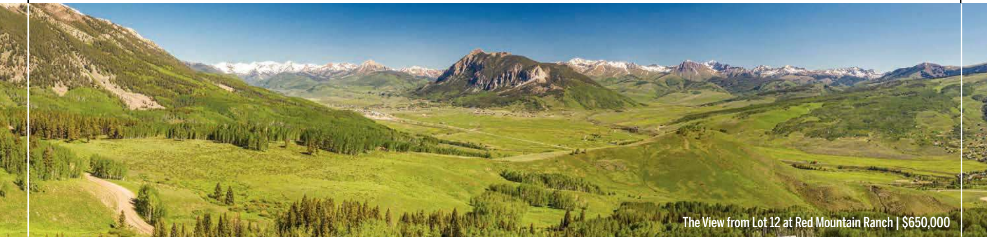
The View from Lot 12 at Red Mountain Ranch | $650,000